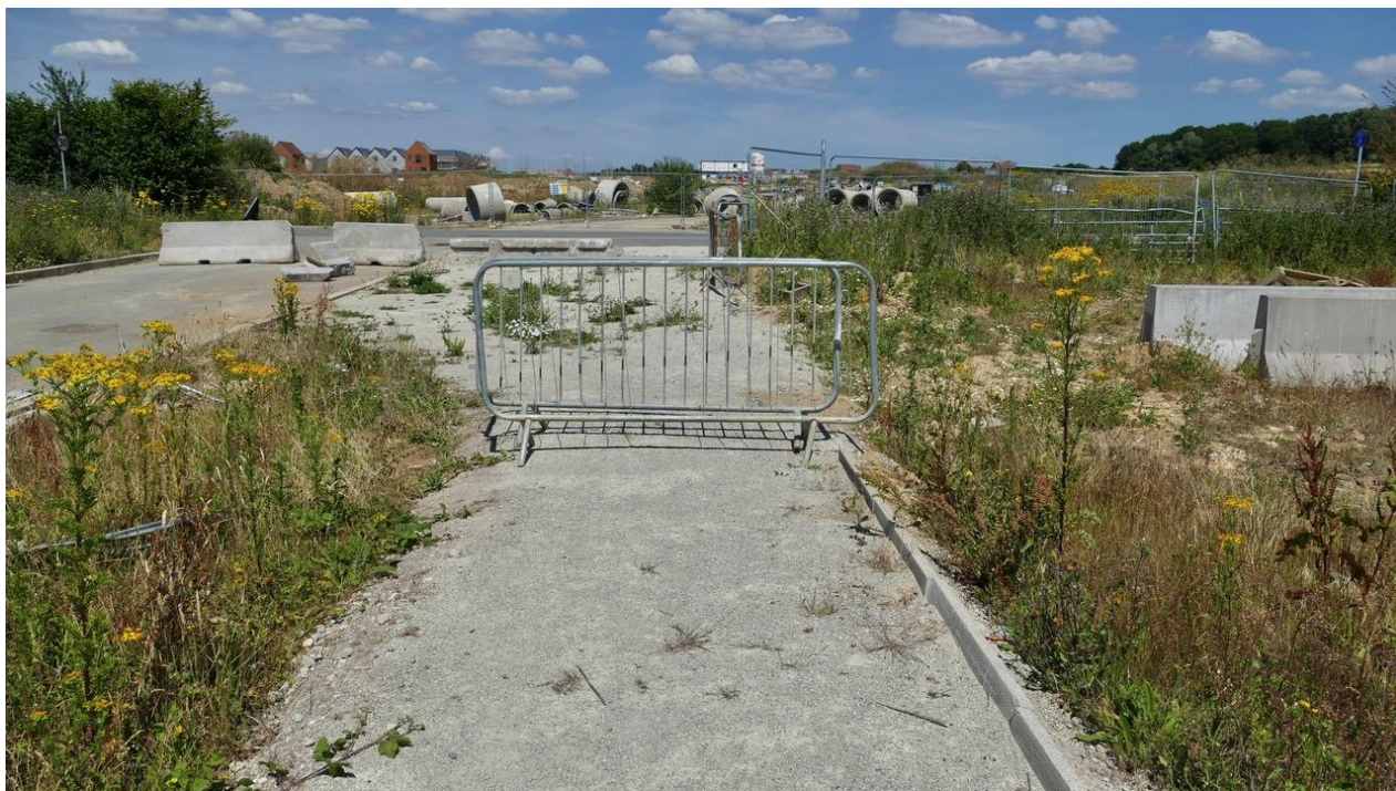
6. Mock Lane (unrestricted speed limit) going over the hill to Singleton. Nowhere to walk.