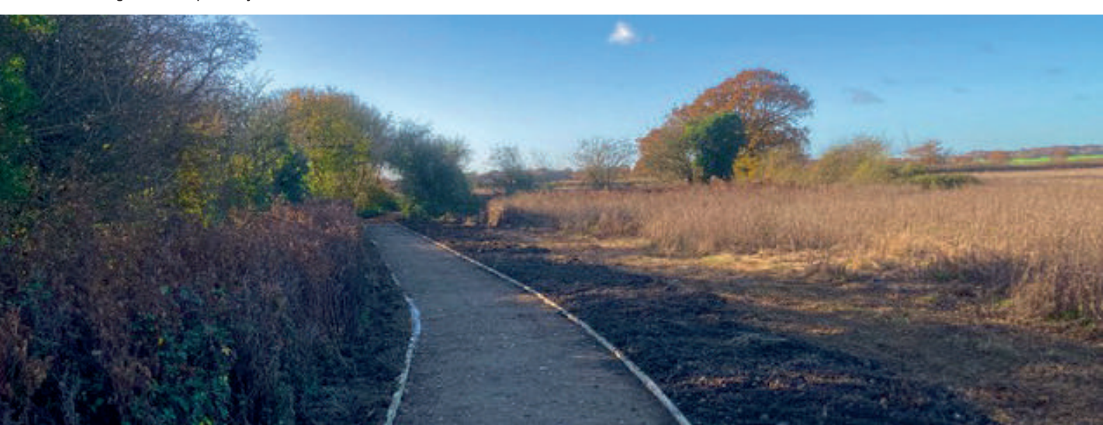
Recently cleared and partially resurfaced footway in Chilmington Green, photo by Ian Wolverson