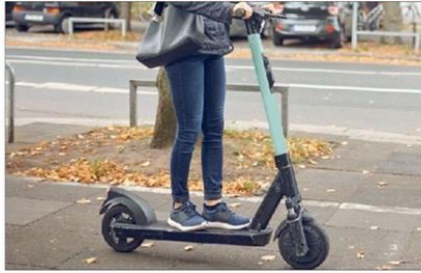
Kent Police seized 190 e-scooters in the two years up to April