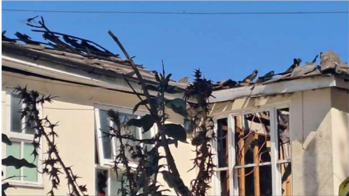
The blaze was started by an e-scooter, according to the fire service

"His loss has left Faversham speechless. He was such a well-loved person, such an amazing character.