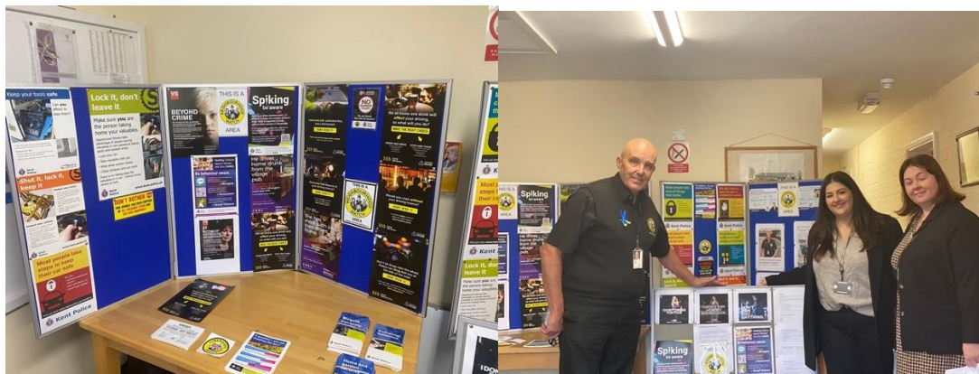
VAWAGs work across the District

In all my work and presentations, I stress to women how they can verify that they are dealing with a Police Officer