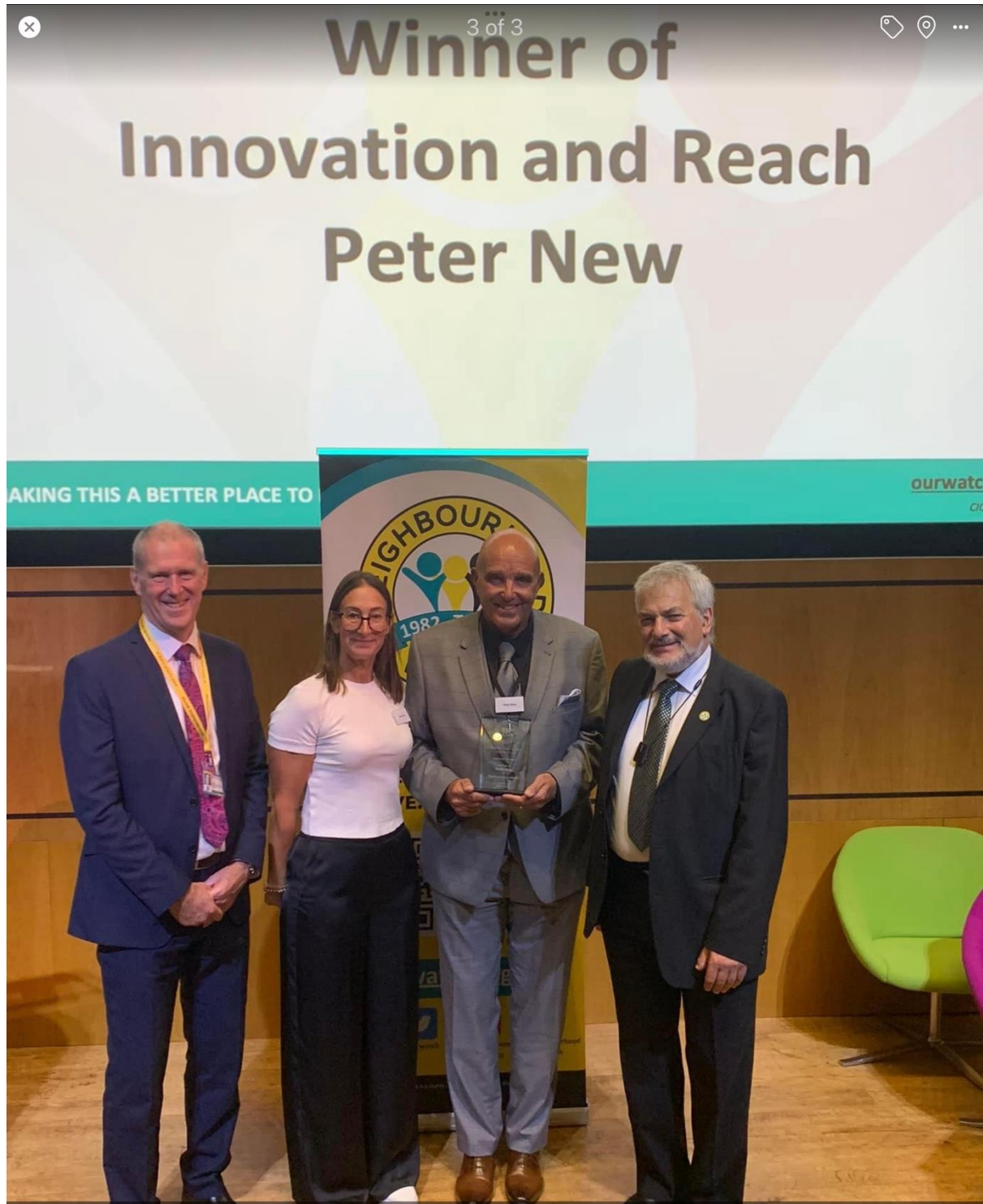
NATIONAL NEIGHBOURHOOD WATCH AWARD

I hope the council reflect on the support and backing you have given me especially in the early struggles and very importantly shall we say with people who did not always see the longer term benefits quick enough.